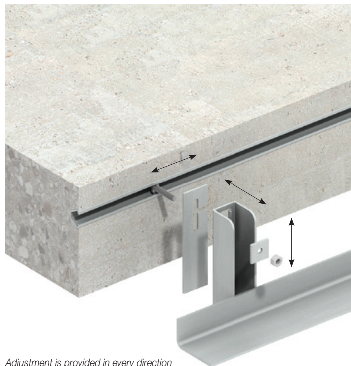
Adjustment is provided in every direction to allow for tolerance in the structural frame