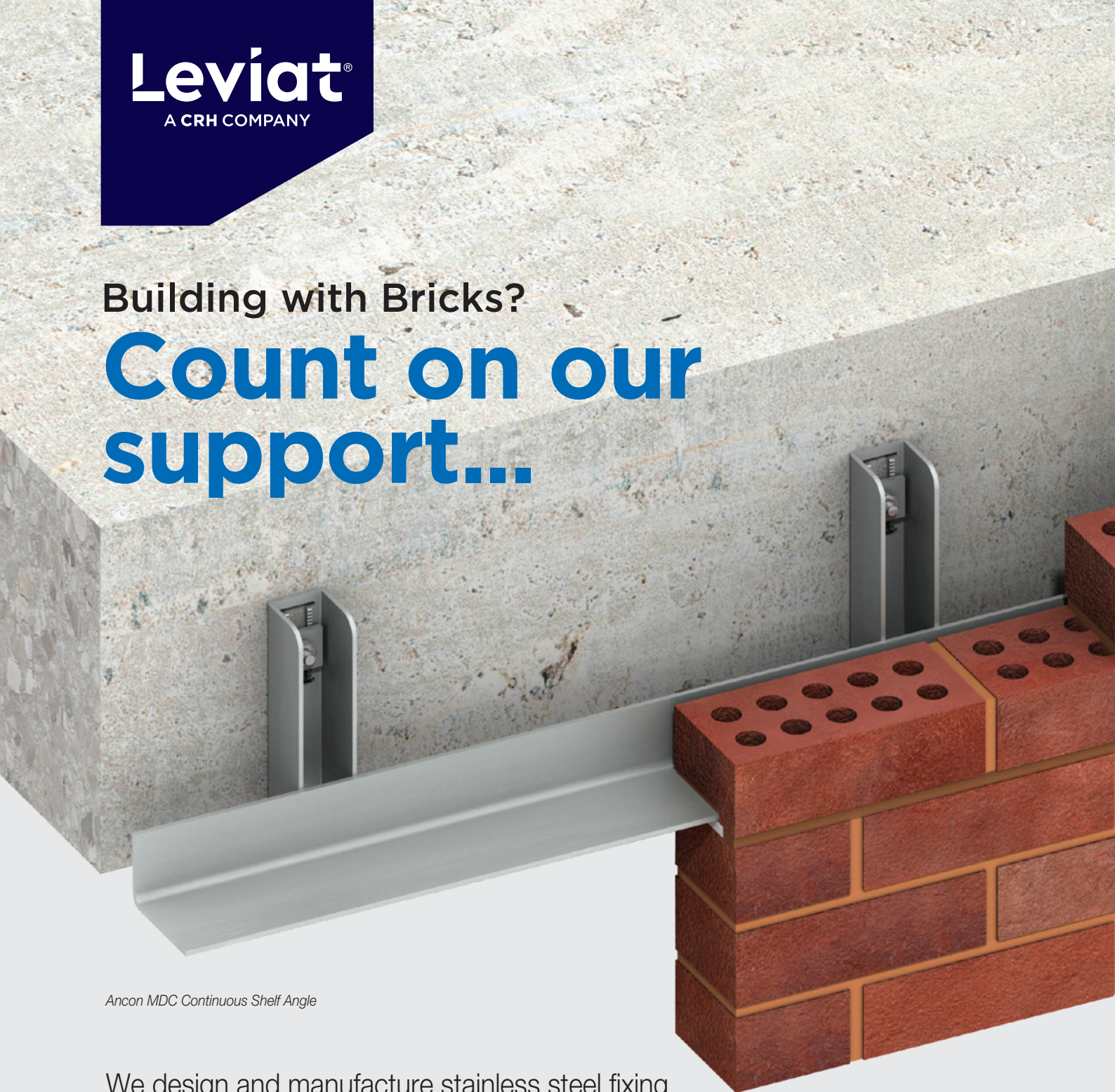
Ancon MDC Continuous Shelf Angle

We design and manufacture stainless steel fixing systems for the support and restraint of brickwork